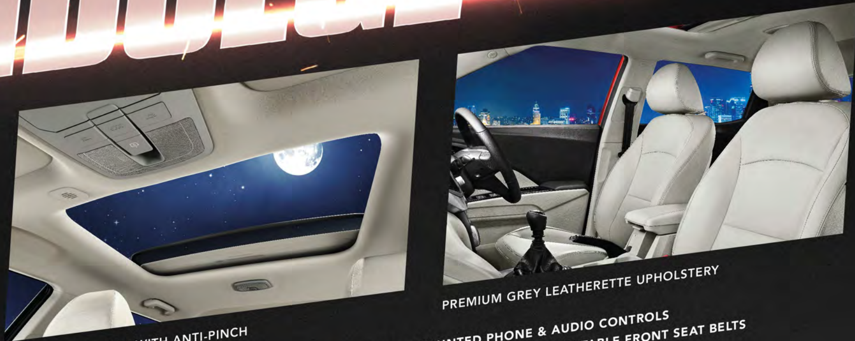
PREMIUM GREY LEATHERETTE UPHOLSTERY