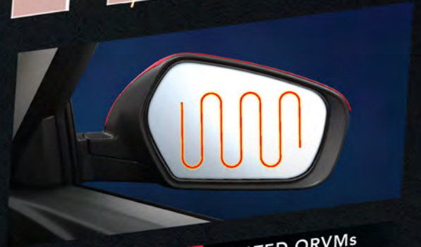
FIRST-IN-SEGMENT HEATED ORVMs

Take on the fiercest winters with these unique, first-in-segment ORVMs. They come with a heating facility that gets rid of mist or frost, giving you a clear view of whatever is lagging behind.