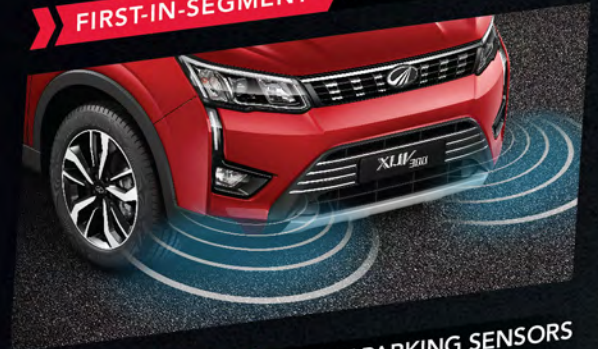
FIRST-IN-SEGMENT FRONT PARKING SENSORS