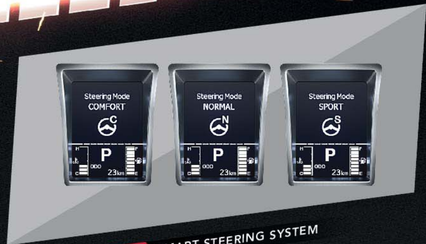
FIRST-IN-SEGMENT SMART STEERING SYSTEM

3 steering modes allow you to customise the steering effort to suit your driving requirements. With the Comfort mode, glide through city traffic with ease. Or, satiate your need for thrill and adrenaline rush with the Sport mode.