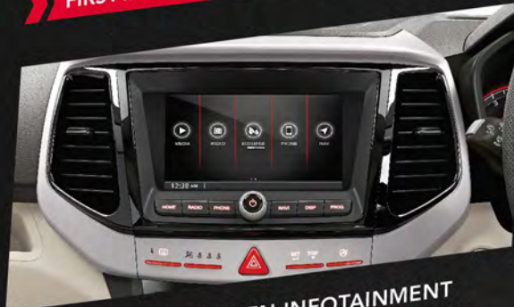
17.78 CM TOUCHSCREEN INFOTAINMENT WITH GPS NAVIGATION, APPLE CARPLAY & ANDROID AUTO™