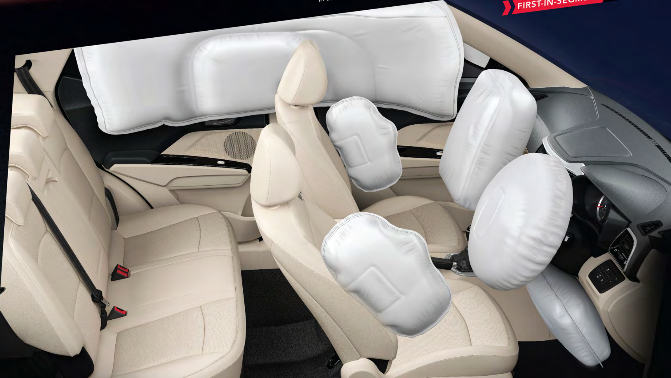
FIRST-IN-SEGMENT 7 AIRBAGS

The XUV300 comes equipped with first-in-segment 7 airbags. They include a knee airbag in addition to dual-front, side and curtain airbags, which provide all-encompassing safety.