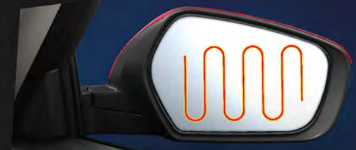
FIRST-IN-SEGMENT HEATED ORVMs