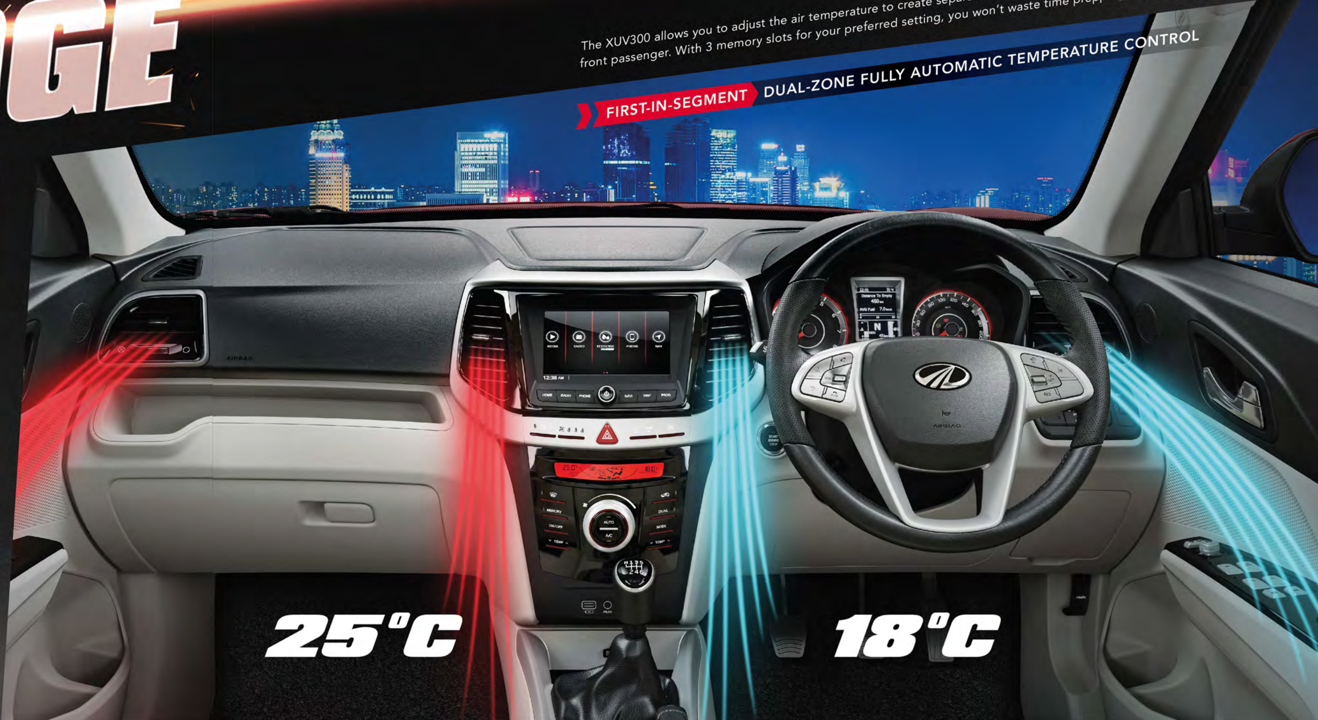
FIRST-IN-SEGMENT DUAL-ZONE FULLY AUTOMATIC TEMPERATURE CONTROL

The XUV300 allows you to adjust the air temperature to create separate, customised environments for the driver and front passenger. With 3 memory slots for your preferred setting, you won't waste time prepping up for your joyride.