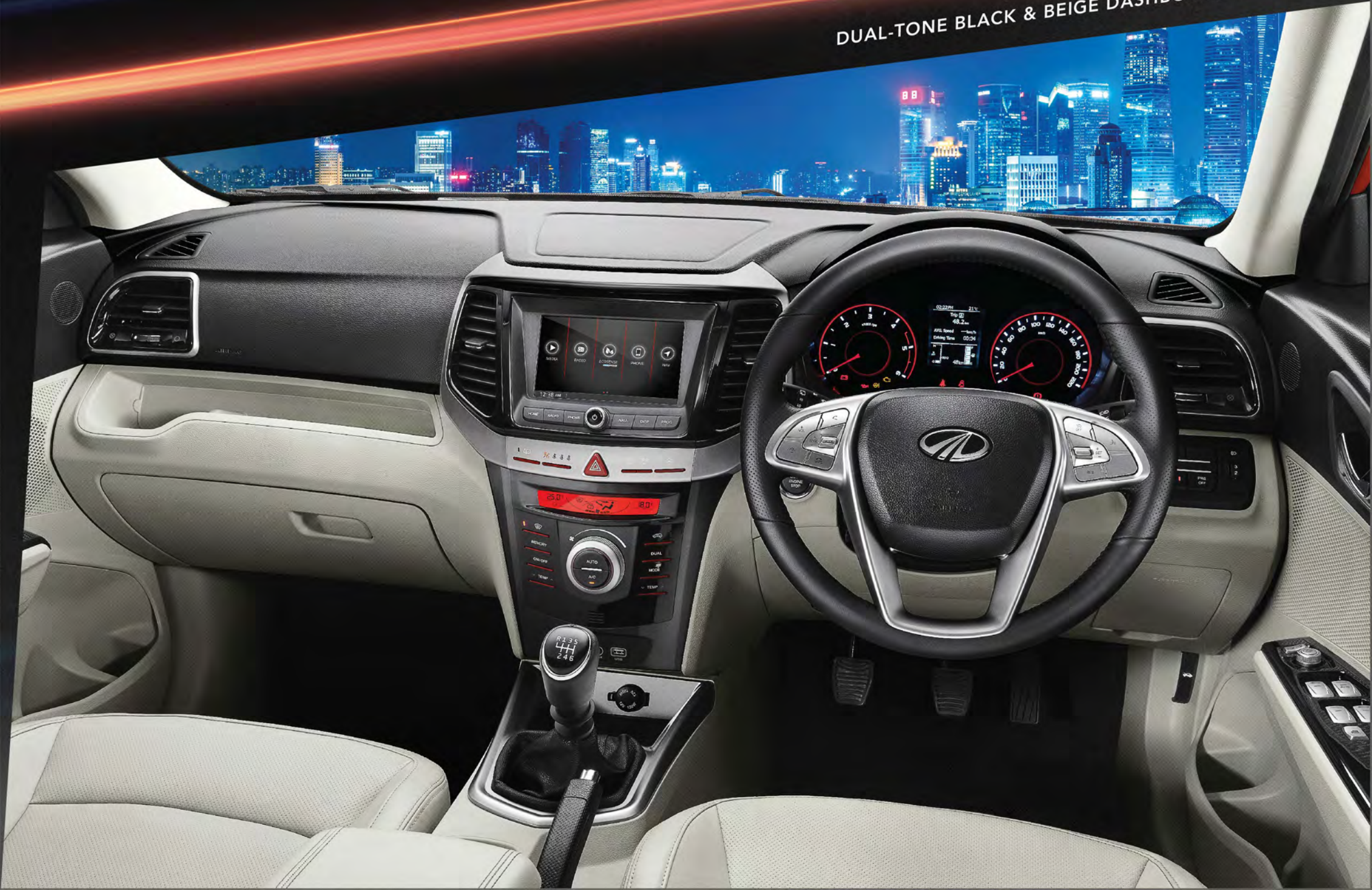
DUAL-TONE BLACK & BEIGE DASHBOARD