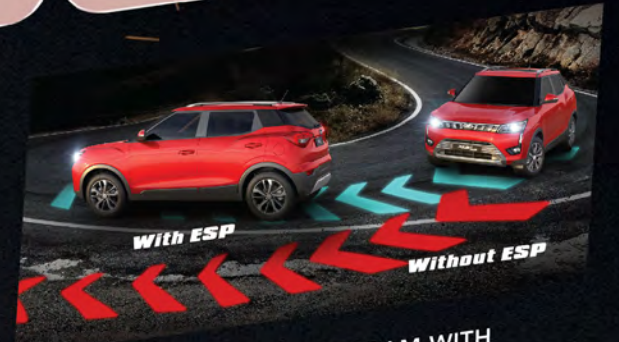
ELECTRONIC STABILITY PROGRAM WITH HILL START ASSIST

Take on the fiercest winters with these unique, first-in-segment ORVMs. They come with a heating facility that gets rid of mist or frost, giving you a clear view of whatever is lagging behind.