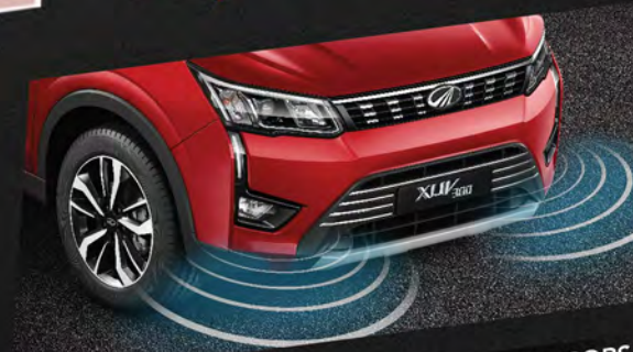
FIRST-IN-SEGMENT FRONT PARKING SENSORS